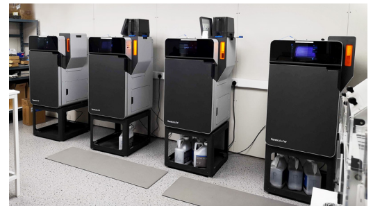
Defender3D use a platform of 4 Formlabs SLS 3D Printers

Based in the UK, Defender3D provides British engineered products with the flexibility of 3D printing at its core. Products range from wireless charging trays, storage solutions, interior lighting brackets, fixtures and casings to mounting components and brackets, that are all specific to the vehicle. With a global client base including UK, Germany, Japan, Australia and USA, Defender3D supplies off-road specialist companies, automotive aftermarket suppliers and enthusiast groups.