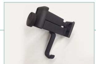
SLS redesigned part